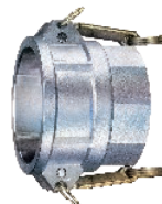
Aluminum Part D Coupler X Female (NPSM Threads)