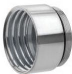
Aluminum Full-Flow Coupling Male (NPSM Threads)