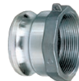
Aluminum Part A Male Adapter X Female (NPSM Threads)